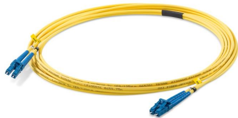
LC-Duplex >> LC-Duplex Cable type: Zipcord I-V(ZN)H 2 X 2,1 mm FRNC-LSZH