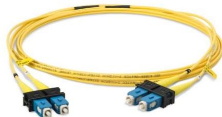
SC-Duplex >> SC-Duplex Cable type: Zipcord I-V(ZN)H 2 X 2,1 mm FRNC-LSZH

Dieses Dokument ist urheberrechtlich geschützt • This document is protected by copyright • Rosenberger OSI GmbH & Co. OHG