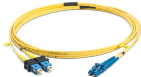
LC-Duplex >> SC-Duplex Cable type: Zipcord I-V(ZN)H 2 X 2,1 mm FRNC-LSZH