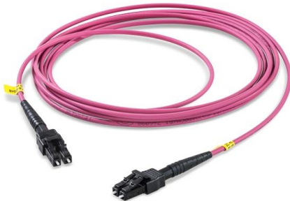
LC-Compact >> LC-Compact Cable type: round I-V(ZN)H 2,8 mm FRNC-LSZH